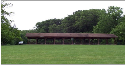
The Picnic Shelter holds about 100 people and is approximately 28 x 50.